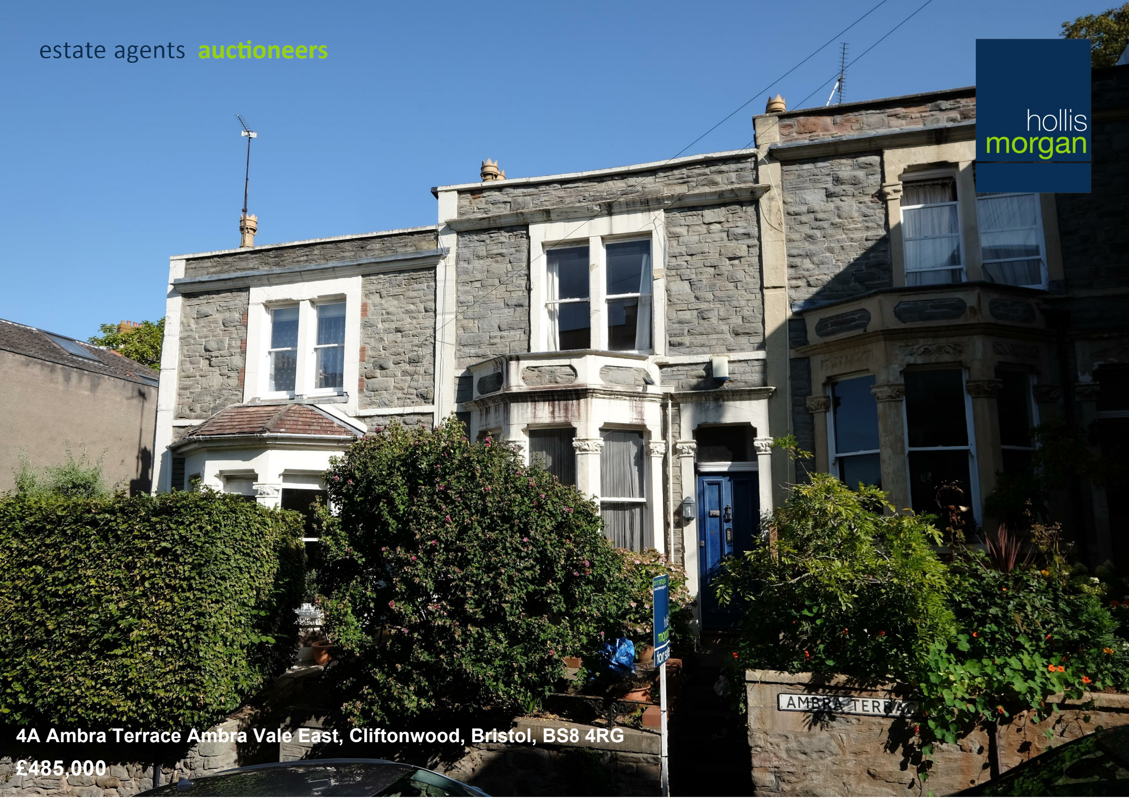
4A Ambra Terrace Ambra Vale East, Cliftonwood, Bristol, BS8 4RG